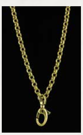
11118 Brass Chain (Approx. 26¾")