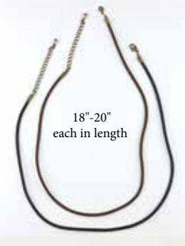
11125 Black Leather Cord 11126 Brown Leather Cord