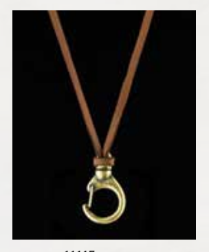
11117 Leather Lanyard (Approx. 34½")