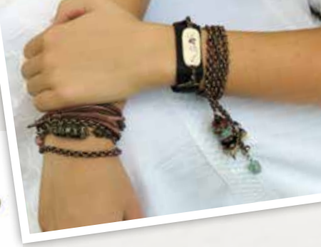
11120 Brass Three Strand Bracelet (6½"- 8¾")