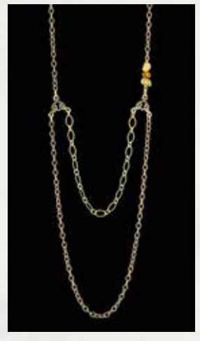
11114 Carnelian Antique Brass (37")