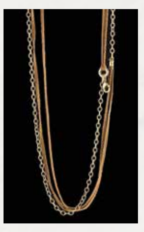
11116 Leather and Chain (25"- 27")

Choose from eight necklace styles, add your favorite Fenton glass for a look that is all you ! The two necklaces shown at the right and left can also be used as wrap bracelets! The possibilities are almost endless.