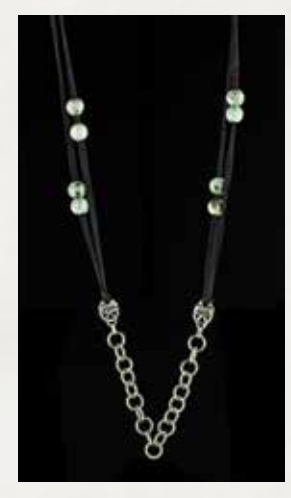
11091 African Turquoise (32"- 34")