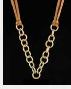
11119 Leather with Brass Circles (34")