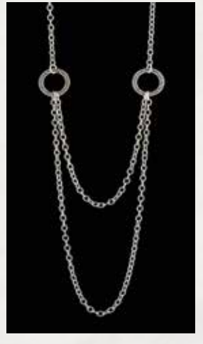
11115 Circles Go Round (38½")